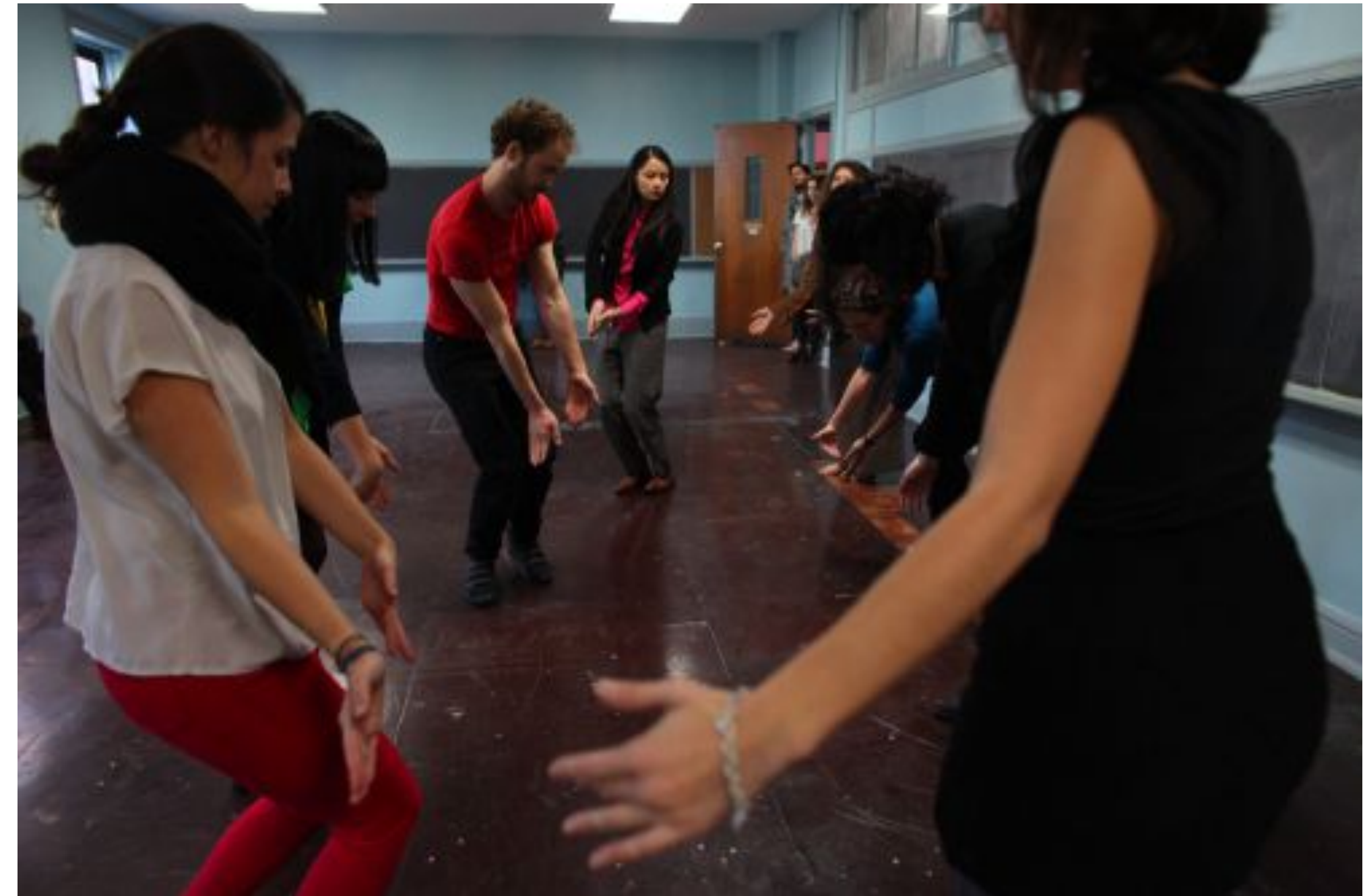
Image credit: Boris Chamatz, Musée de la Danse: Expo Zéro, Performa 11.

( http://17.performa-arts.org/events/forever-and-a-day-archiving-performa ).