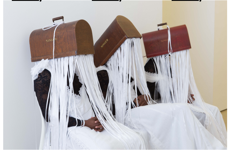
( http://17.performa-arts.org/events/nicholas-hlobo )