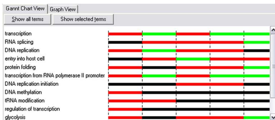
Fig. 3 Gantt chart view of selected GO terms. Each bar represents a window of time, with up-regulated terms labeled in red, down regulated terms in green and terms not enriching any cluster in the window labeled with black

We also suspect that what is true of the biological examples presented here may also hold for many other domains: e.g., financial domains with syntactic variables: prices and volumes of stocks, and information retrieval domains with syntactic variables: click streams or hyperlinks. The GOALIE system is designed to be highly