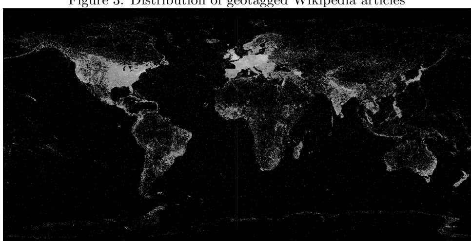
Figure 3: Distribution of geotagged Wikipedia articles

we can make out." In one experiment, "Internet users [were asked] to write down as many wars as they could remember in five minutes." He reports that "the responses were heavily weighted toward the world wars, wars fought by the United States, and wars close to the present[38]."