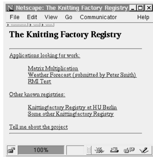
Figure 1: Main page of a KnittingFactory registry

Arbitrary Origin of Applets: In a typical collaborative application, applets are downloaded from an HTTP server and establish a connection to another participant. Under Java's host-of-origin policy, an applet can connect only to the host it was downloaded from, which means that an initiator application must be running on the same host as the HTTP